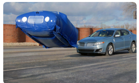
Adaptive cruise control and collision warning with brake support balloon-testing on Lincoln MKS.