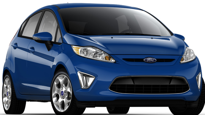
2011 Ford Fiesta

There is no additional monthly fee for 911 Assist since SYNC utilizes a customer's existing mobile phone.