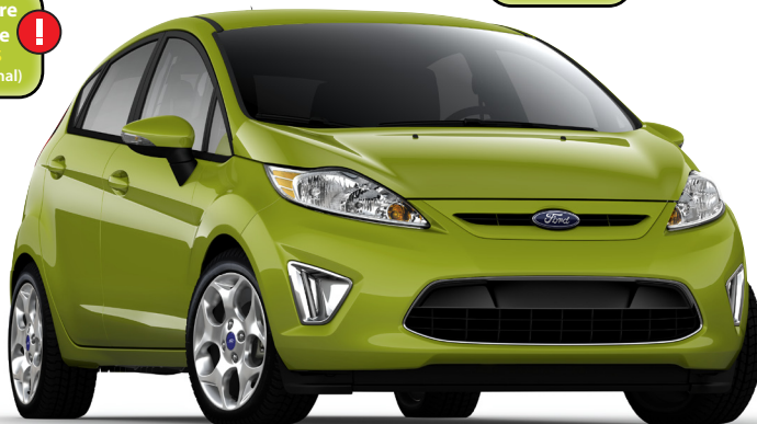
2011 Ford Fiesta

The VHR system translates complicated codes and descriptions into easy-to-understand language for users and provides recommended actions specific to vehicle's operating condition and service history. It also gives users background information on what specific warning indicators mean and details beyond a light. This helps them learn more about their car and provides additional security and peace of mind with their ownership experience. Even if the SYNC-monitored vehicle systems are "all green," VHR provides valuable information about systems operation, maintenance and more. Users also have the option to set up SYNC to automatically remind them to run a VHR when it's time to perform scheduled maintenance. Through a single button click, users can also reproduce their VHR and profile information in Ford's online appointment system to schedule service directly with their preferred dealership.