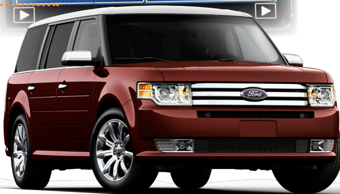
2010 Ford Flex

HD Radio technology provides broadcasts with dramatically better sound quality thanks to digital transmission – FM sounds like a CD and AM sounds like today's FM broadcasts. And unlike analog broadcasts, digital broadcasts aren't susceptible to interference, fadeout and other issues.