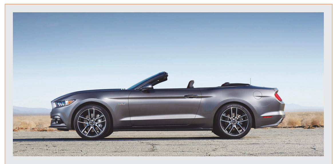
Mustang Convertible features unique rear bodywork that gives it clean, cohesive lines and a presence on the road that is all its own.

Few activities evoke a feeling of freedom and optimism better than dropping the top on a Ford Mustang Convertible and hitting the open road. The all-new Mustang Convertible was designed and engineered from the ground up in parallel with the Fastback to ensure it met the same exacting standards of quality, refinement and style. The fully lined top is both better looking and functional in that it now makes the cabin even quieter with the top up. The standard cloth outer layer provides Mustang Convertible with an even more upscale appearance.