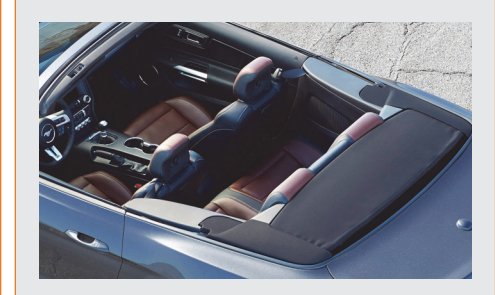
Simple snap-in side caps complete the clean top-down appearance and stow easily in the trunk.

The newly designed top system folds into a flatter and more compact stack than the previous Mustang Convertible. The highest point of the folded top is now 6.7 inches lower than before and the new electromechanical drive stows the top in just seven seconds, twice as fast as before.