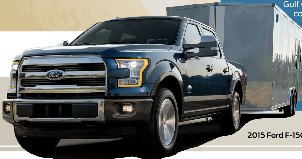
2015 Ford F-150