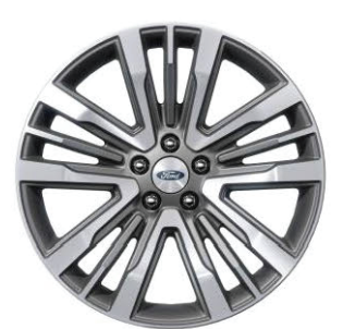
20" Bright Machined-face Aluminum with Tarnished Dark Painted Pockets (Std. Platinum)