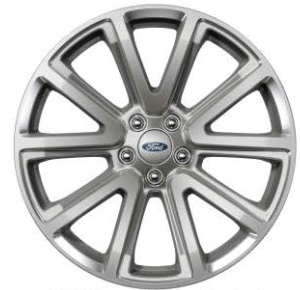
20" Premium Painted Aluminum (Std. Limited)