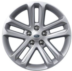
18" Painted Aluminum (Std. Base and XLT FWD)