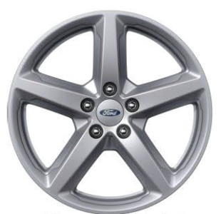
18" 5-spoke Painted Aluminum (Std. XLT 4WD; Opt XLT FWD with 3.5L engine)