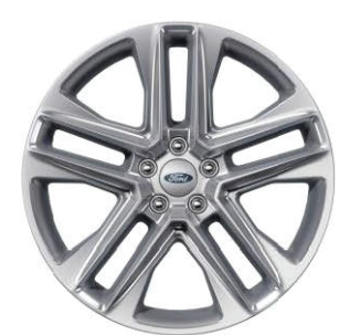
20" Polished Aluminum (Opt. XLT and Limited)