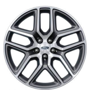
20" Machined-Aluminum with Painted Pockets (Std. Sport)