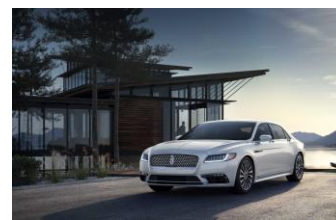
2017 Lincoln Continental

With its first-ever major redesign, the 2017 Ford F-Series Super Duty – America's best-selling heavy-duty pickup truck – further raises the bar with a new high-strength, military-grade, aluminum-alloy body. With multiple new chassis, powertrain and technology features, it is the toughest, smartest, most capable Super Duty ever.