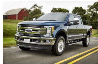
2017 Ford F-Series Super Duty

With its first-ever major redesign, the 2017 Ford F-Series Super Duty – America's best-selling heavy-duty pickup truck – further raises the bar with a new high-strength, military-grade, aluminum-alloy body. With multiple new chassis, powertrain and technology features, it is the toughest, smartest, most capable Super Duty ever.