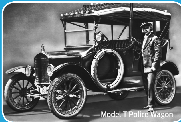
Model T Police Wagon