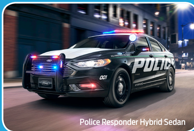
Police Responder Hybrid Sedan

Partnering with cities on custom law enforcement vehicles