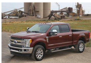
Ford F-Series Super Duty

Customers continue to favor high series Super Duty pickups. Last month, average transaction pricing for Super Duty moved above $55,000 per truck – a $5,500 increase. This is $7,000 more than the average transaction pricing of the luxury segment, at $48,000.