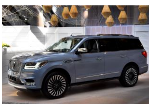
2018 Lincoln Navigator

Explorer retail sales rose 6.1 percent last month. We're seeing continued growth, particularly in the larger east coast markets, with Boston sales increasing 10 percent, Philadelphia up 21 percent and a gain of 18 percent in the country's largest SUV market – the New York area.