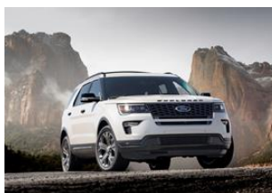
2018 Ford Explorer

Our new 2018 F-150 just went on sale. Order banks are showing 54 percent of customers requesting Lariat, King Ranch, Platinum and Limited series trucks, with 88 percent in SuperCrew and almost 60 percent equipped with our 3.5-liter EcoBoost® V6.