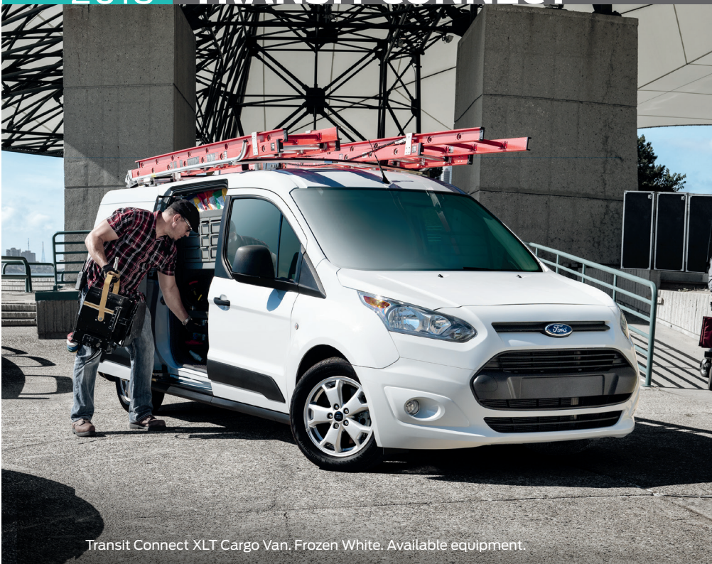
Transit Connect XLT Cargo Van. Frozen White. Available equipment.