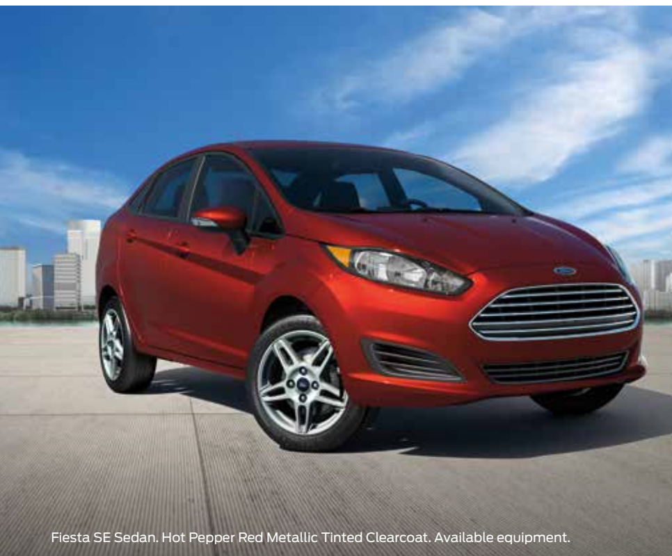
Fiesta SE Sedan. Hot Pepper Red Metallic Tinted Clearcoat. Available equipment.

Models: S, SE (Sedan); SE, ST (Hatchback)