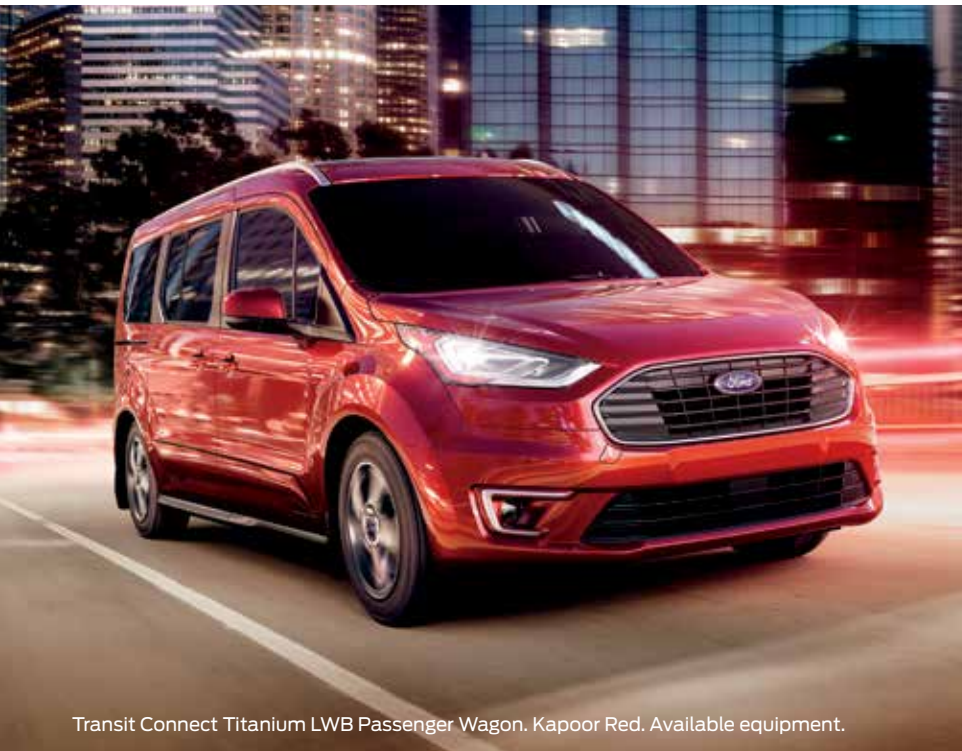
Transit Connect Titanium LWB Passenger Wagon. Kapoor Red. Available equipment.

Small Vans Class 1 Models: XL, XLT, Titanium