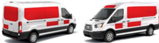
Decal #4 (61E): – Up to 70 sq-ft 1