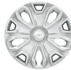
16" Steel Wheel with Full Silver Wheel Cover

(Standard on All SRW Models, Excluding XLT Passenger Van)