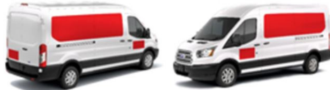
Decal #3 (61D): – Up to 45 sq-ft 1