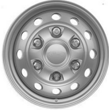
16" Silver Steel Wheel with Exposed Lug Nuts

(Standard on DRW Cargo Van and Passenger Van Models)