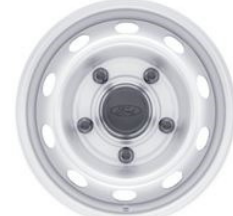
16" White Steel Wheel with Mini-Cap and Lug Nut Covers

(Optional on All SRW Models. Fleet Only) – 64C