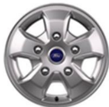
16" Easy to Clean Styled Aluminum Wheel

(Standard with SRW XLT Passenger Van. Optional for SRW Cargo Van, Cutaway, Chassis Cab and SRW XL Passenger Van. Included with Exterior Upgrade Package) – 64H