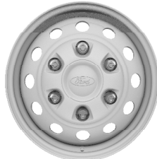
16" White Steel Wheel with Exposed Lug Nuts

(Standard on DRW CC/CA Models. Optional on DRW Cargo Van and Passenger Van Models. Fleet Only)