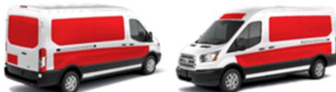
Decal #5 (61F): – Up to 95 sq-ft 1