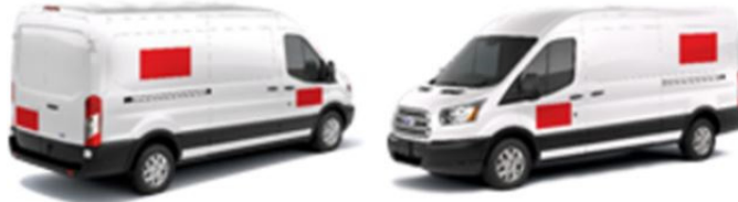
Decal #1 (61B): – Up to 15 sq-ft 1