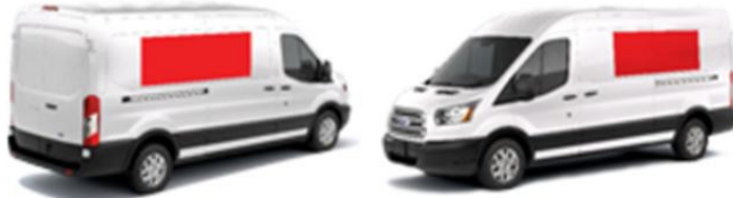
Decal #2 (61H): – Up to 25 sq-ft 1