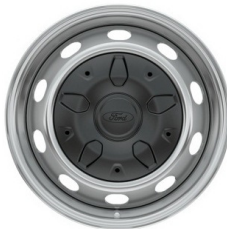
16" Steel Wheel with Black Hubcap

(Standard on All SRW Models, Excluding XLT Passenger Van)