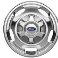
16" Forged Aluminum Wheel

(Standard on DRW Cargo Van and Passenger Van Models)