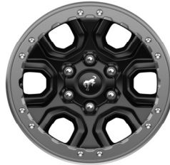
17" Black High Gloss-Painted Aluminum, with Warm Alloy Beauty Ring, Beadlock Capable (Included in Sasquatch™ Package (765) for all series except Wildtrak™. Package availability is optional on Base, Big Bend™, Black Diamond™, Outer Banks™, Badlands™)