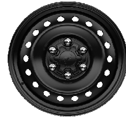
17" Black Gloss-Painted Steel (Standard on Black Diamond™)