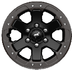
17" Black High Gloss-Painted Aluminum with Carbonized Gray Beauty Ring, Beadlock Capable (64W) (Optional on Badlands™)