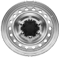
16" Bright Polished Silver-Painted Steel (Standard on Base)