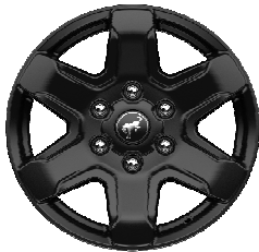
17" Black High Gloss-Painted Aluminum (64H) (Optional on Black Diamond™)