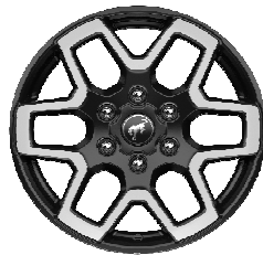
18" Bright Machined Black High Gloss-Painted Aluminum (Standard on Outer Banks™)