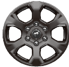
17" Carbonized Gray-Painted Aluminum (Standard on Big Bend™)