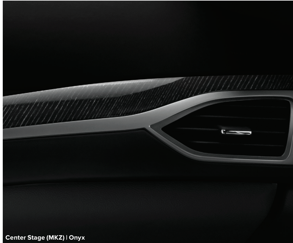
Center Stage (MKZ) | Onyx

“The various designer woods demonstrate the level of detail that went into developing each Lincoln Black Label theme.”